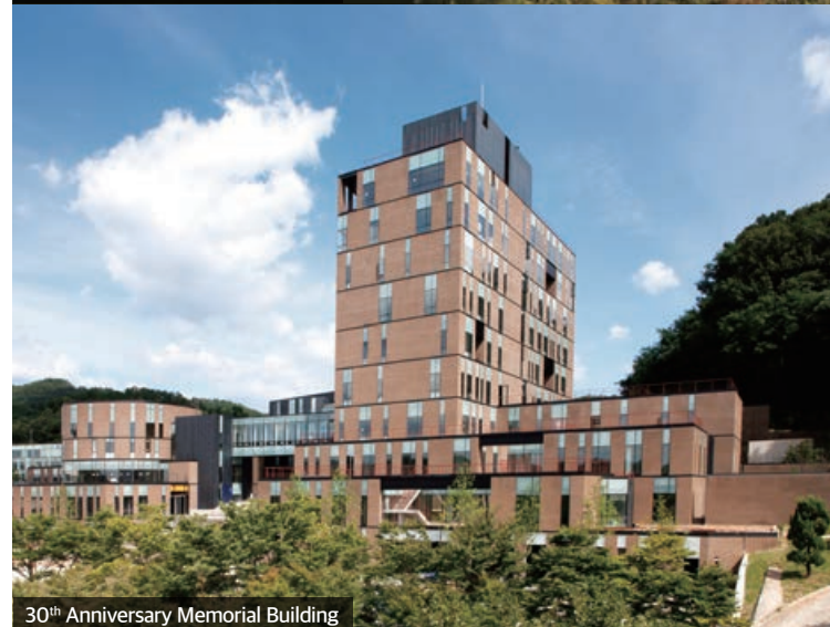
30th Anniversary Memorial Building