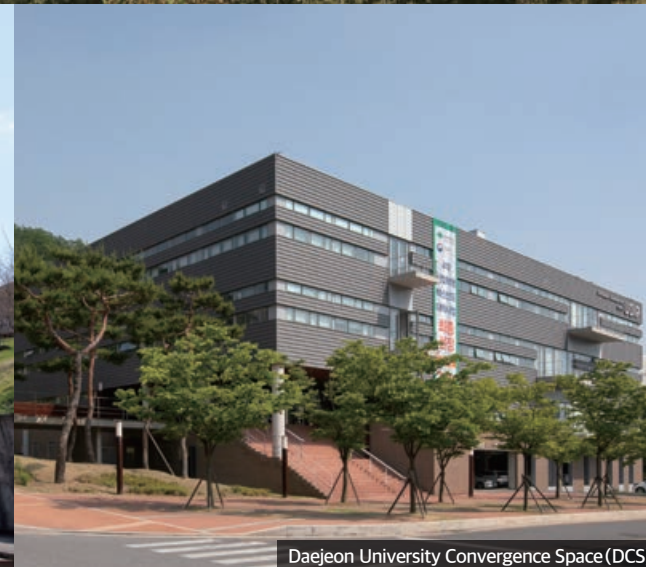
Daejeon University Convergence Space(DCS)