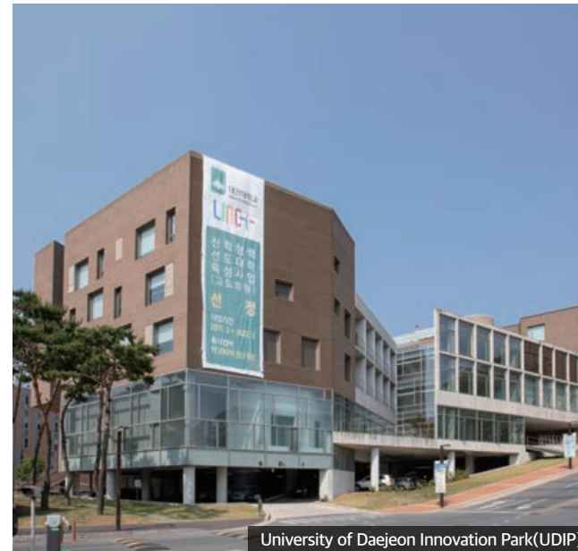
University of Daejeon Innovation Park(UDIP)