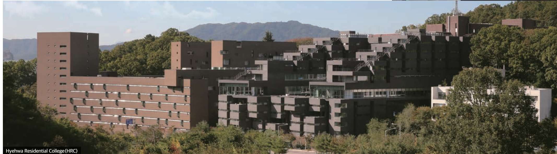
Hyehwa Residential College (HRC)