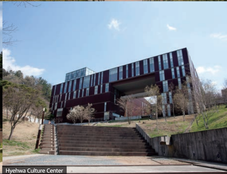
Hyehwa Culture Center